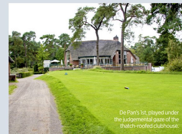
De Pan's 1st, played under the judgemental gaze of the thatch-roofed clubhouse.

To restore the 7th green to its original using old aerial pictures. Green 5 is another altered green that does not fit with the rest. This situation is more complicated as the green was both altered and moved to a different location. It will need some thorough analysis and design work in the future to come up with a solution that has the same quality as the rest of the course.