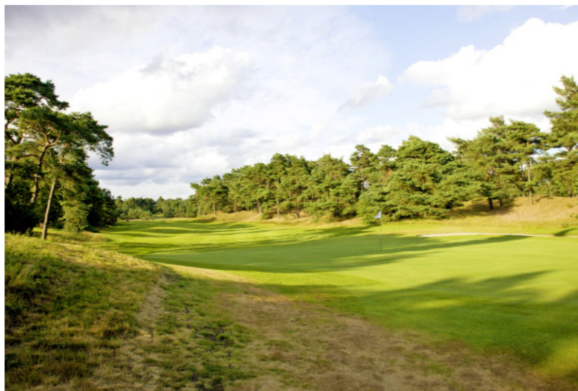
ABOVE: The 9th is a solid par 4 played along an undulating fairway to a rather small green that is difficult to putt on. LEFT: The bunkers to the front of the 18th are penal, but otherwise this is a scoreable way to end a course that does not intimidate. BELOW: Typically characterful green complexes at this Dutch masterpiece.